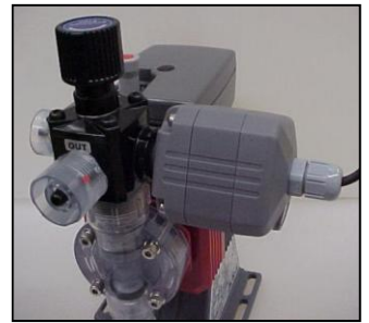
Installing the PosiFlow ® Sensor into the Multi-Function Valve.