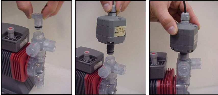
Installing the PosiFlow ® Sensor into the manual air vent valve.